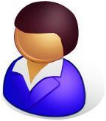
State Agency/ Procurement Officer